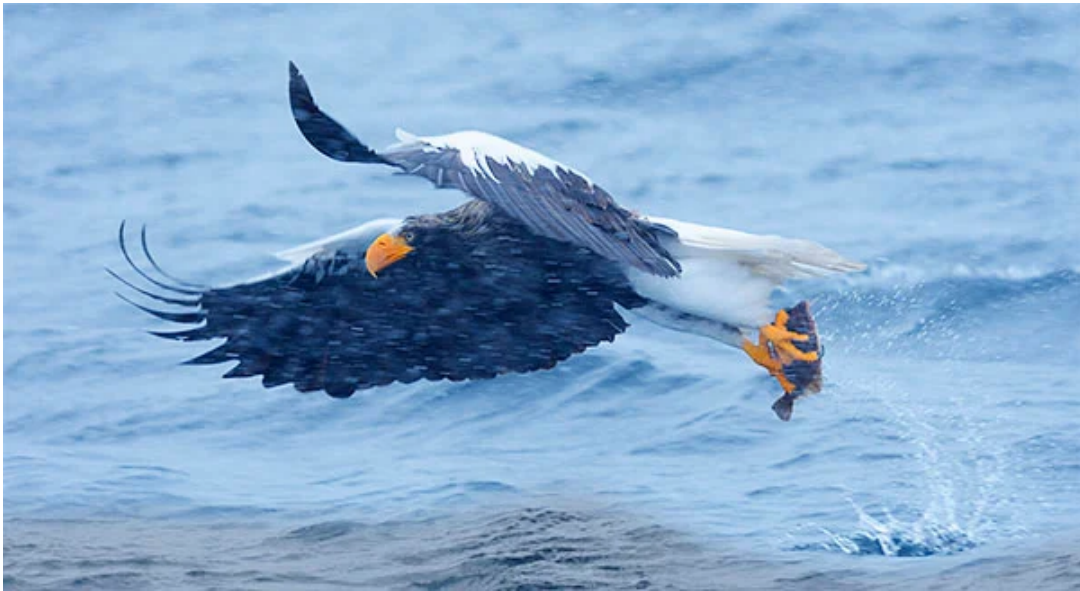
Steller's Sea Eagle (Haliaeetus pelagicus)

Japan isn't a country people usually associate with exciting wildlife, but it is actually surprisingly diverse. I've made three trips, and thoroughly enjoyed each of them, but my favourite site is the remote Shiretoko National Park on the northern island of Hokkaido.