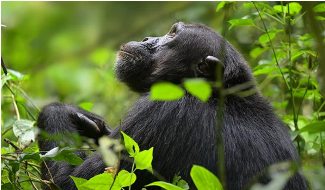
Chimpanzee ( Pan troglodytes ) in Kibale National Park, Uganda