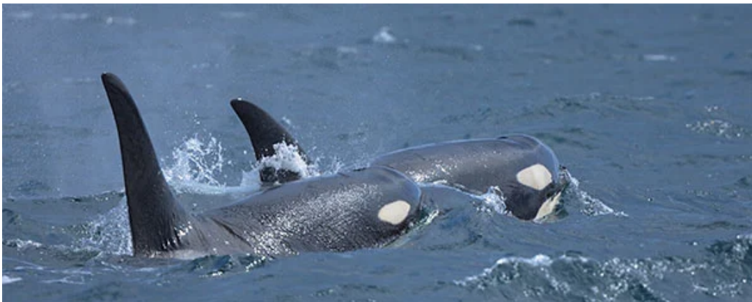
Orca (Orcinus orca)

Whatever time you visit there's always something exciting to see in this beautiful, remote corner of the north-west Pacific.